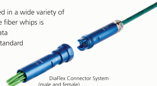
DiaFlex Connector System (male and female)

The DiaFlex connector is versatile and can be used in a wide variety of applications. The Fan-Out version with its flexible fiber whips is typically used for broadcasting, de-centralized data centers and industrial process automation. The standard connector version is used in auto racing for data transmission, as well as, in other environments where robust and reliable connectors are required.